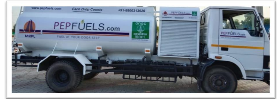
Doorstep Diesel Delivery via Bowser

Please include photos of your solutions, devices etc.