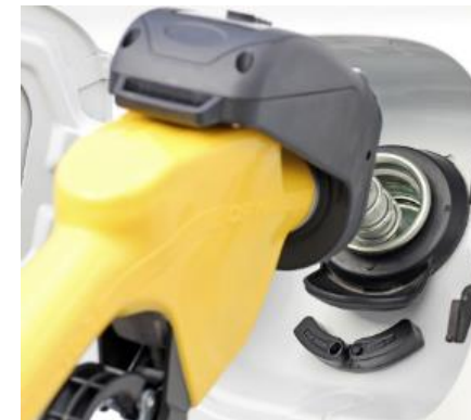
IoT-RFID based Fuelling